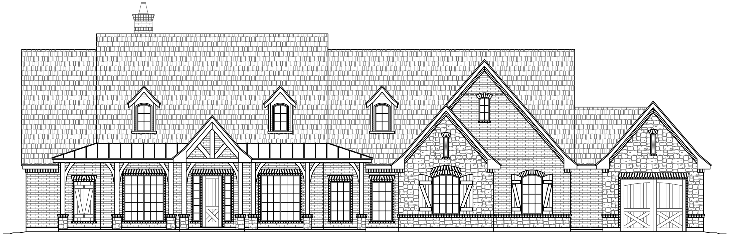
- PRELIMINARY FRONT ELEVATION -